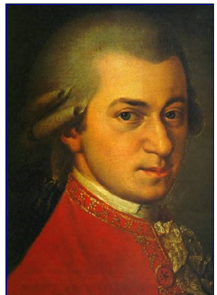
Wolfgang Amadeus Mozart (1756–1791), classical composer of over 600 works, including operas in German and Italian