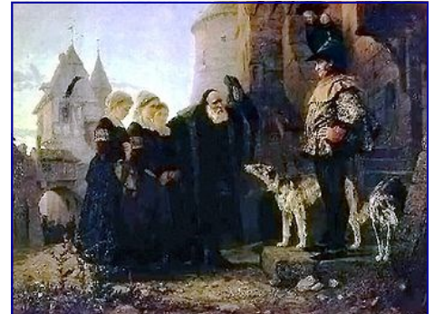
Le droit du Seigneur (1874) by Russian painter Vasily Polenov (1844–1927)

The most famous droit de seigneur (or droit du seigneur ), the right of local landowners to sleep with newlywed brides, is popularly interpreted as an example of feudal tyranny. However, there is only one piece of medieval testimony indicating anything like actual sexual relations