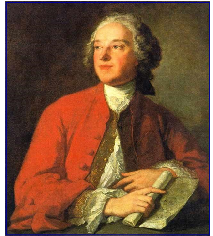
Pierre-Augustin Caron de Beaumarchais (1732–1799), best known for his three Figaro plays

All of Mozart's characterizations are deeper and richer than those of Beaumarchais; the Countess' arias, which make her so human and sympathetic, have no counterparts in the play. Mozart and Da Ponte also removed some of the sexual innuendo between the Countess and Cherubino, creating a safer, typical adolescent character with a crush on an older woman. The essential humanity of each individual, whether nobleman or servant, received the same thoughtful treatment by Mozart and Da Ponte, so the Beaumarchais play about The Crazy Day ( La folle journée ), became a wonderfully heartwarming and enduring opera, The Marriage of Figaro ( Le nozze di Figaro ).