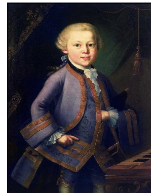
Wolfgang Amadeus Mozart (1756–1791)

Mozart's genius became evident during his short life—most often revealed subtly through the skill and artistry of his music.