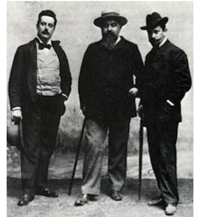
Puccini, Illica, Giacosa

After Verdi, Giacomo Puccini (1856–1924) is considered the most important composer of Italian opera. He is credited with bringing the verismo style to opera because his subjects and characters portray everyday life. Puccini's operas are known for their memorable melodies that are even recognizable to people who don't listen to opera. Remember the music that soared in the background in the movie Moonstruck ?